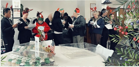
JCNr Choir performing at the Clark Senior Center