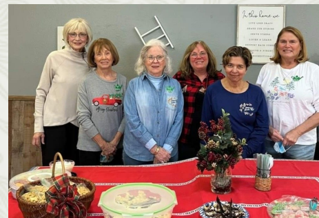
Bittersweet Garden Club